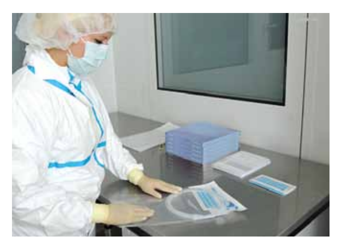
Packaging of drug-coated balloon